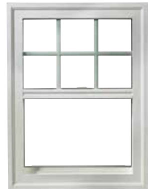
Builders' single hung with integral brickmould.