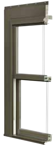
Shown with optional painted exterior and optional flat casing.