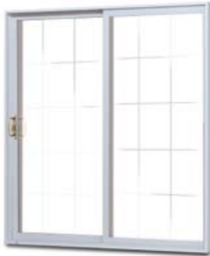
V-GROVED GLASS SHOWN

Continuous Frame Design allows for transom and door to be constructed into one frame